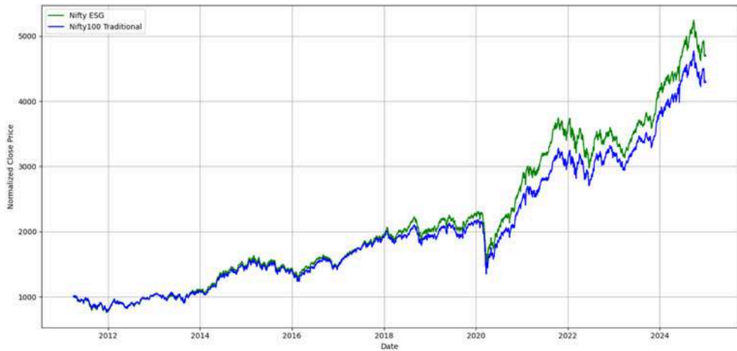
Figure 1 : Normalized Price Performance Comparison