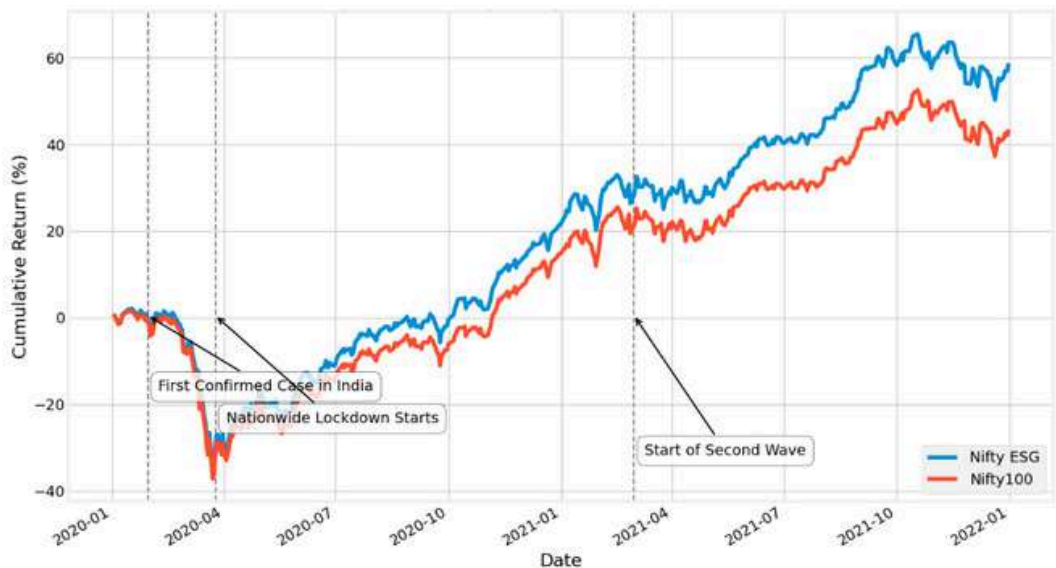
Figure 4 : Cumulative Returns Comparison[Covid Period]

The COVID-19 pandemic in 2020-2021 shook financial markets around the world. It was the toughest test since the 2008 global financial crisis, giving investors a chance to see how ESG companies perform in extreme conditions. Many global studies found that ESG-focused indexes did better than traditional ones, and the Indian case is no different.